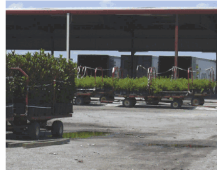
Interstate Transport handles all of The Home Depot's live plant shipments.

Three Way Logistics. Medical electronics, space satellites, computer servers. www.threeway.com