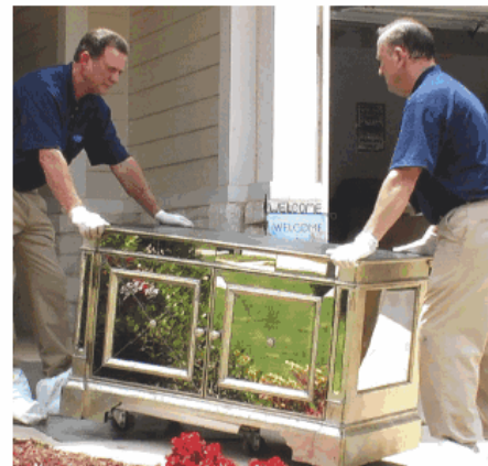
TechTrans specializes in inside deliveries of high-value, fragile items.